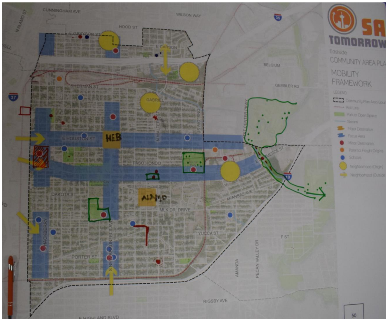
Recording of the Planning Team's discussion of key origins and destinations.