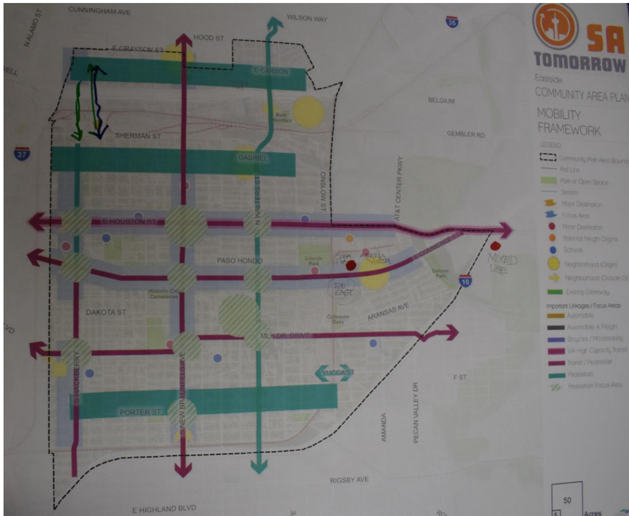
Recording of the Planning Team's discussion of key transit linkages and pedestrian focus areas.