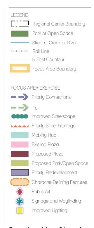
Focus Area Maps Discussion Topics

On New Braunfels Avenue, priority street frontage was identified on the blocks south of Houston Street. Wayfinding and improved streetscaping were identified for blocks adjacent to the Historic Cemeteries. In the blocks north and south of Porter Street, improved streetscaping was identified, to reinforce the concept of this area serving a southern gateway into the plan area. Improved lighting was identified for the area south of lowa Street to I-10.